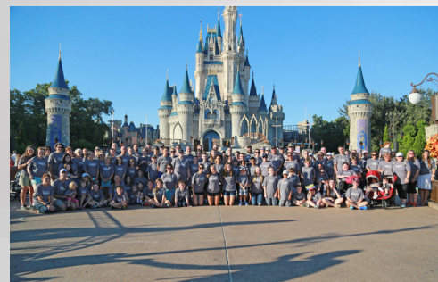
October - Orlando