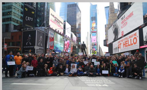
November - New York City