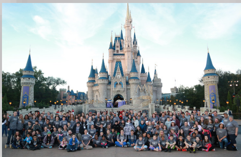
January - Orlando